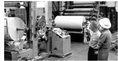
Above: Paper Mill photo courtesy of Willamette Falls Heritage Foundation.

"Newcomers to the area often think industry doesn't belong here," says Sandy. "But they don't realize that it was industry that built this place." Sandy will have copies of the 424-page book for sale at $35 each.